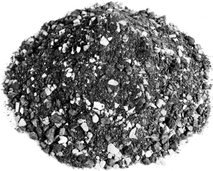
System Substrate for intensive green roofs.

Order No. 6020 / 614101 / 614201 / 614301