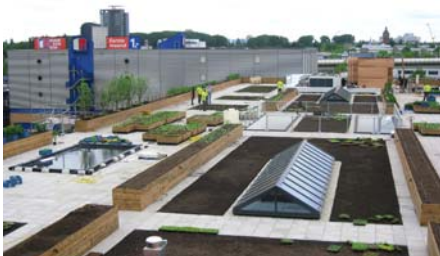
The system build-up "Sedum Carpet" with Fixodrain® XD 20 was applied between the skylights ...