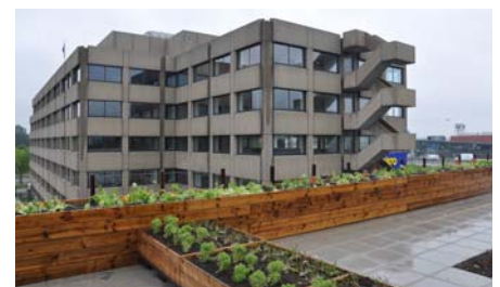
The green roof can be seen perfectly from the offices of the higher opposing building - a welcome change in an area predominated by industrial buildings.