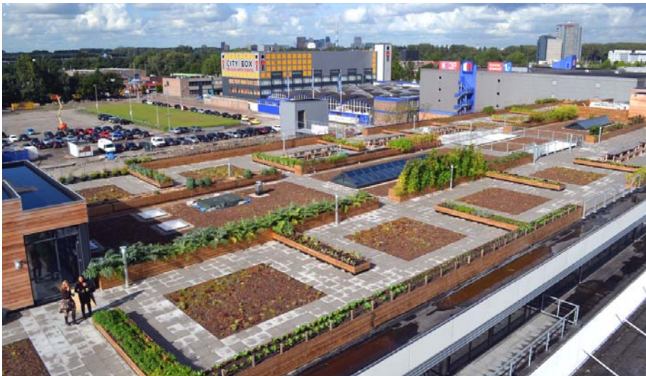
The rooftop farm of Zuidpark can be used both for lunch and for corporate events.