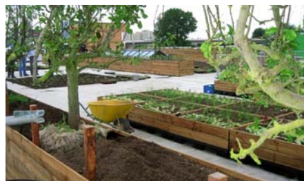
... whereas the build-up "Urban Rooftop Farming" including FD 40-E was applied on the raised planting beds.