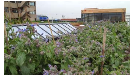
Even herbs, such as the beautifully flowering borage are growing in the small vegetable gardens of the rooftop farm.

the approximately 30 x 100 m large roof. The staff of this commercial complex has the possibility to grow and maintain their own fruits and vegetables on one part of the roof surface. On the rest of the surface, vegetables are also being grown, which are used in the company canteen. Here the system build-ups "Urban Rooftop Farming" on the proven Floradrain® FD 40-E element as well as "Sedum Carpet" with Fixodrain® XD 20 have been applied.