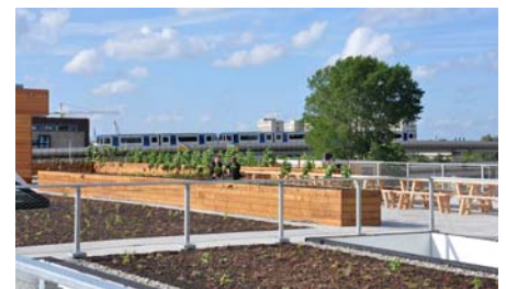
Shortly after the completion of the roof area, the extensively vegetated areas in the foreground.