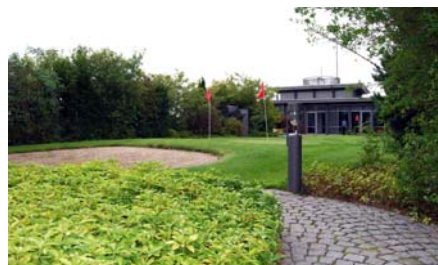
The sand bunker in the rear part of the roof makes the game more challenging.