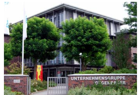
Unexpected sports activities take place on the 15 m high roof of this administrative headquarters of a company in Brandenburg.