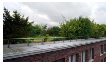
The hedge surrounding the golf course on the roof has become a paradise for birds.