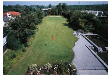
A colourful mix of Forsythia, Weigela, Buddleia and Amelanchier surrounds the small golf course and acts also as a windbreak.