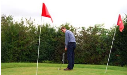
This three-hole golf course invites to play not only during lunchtime.