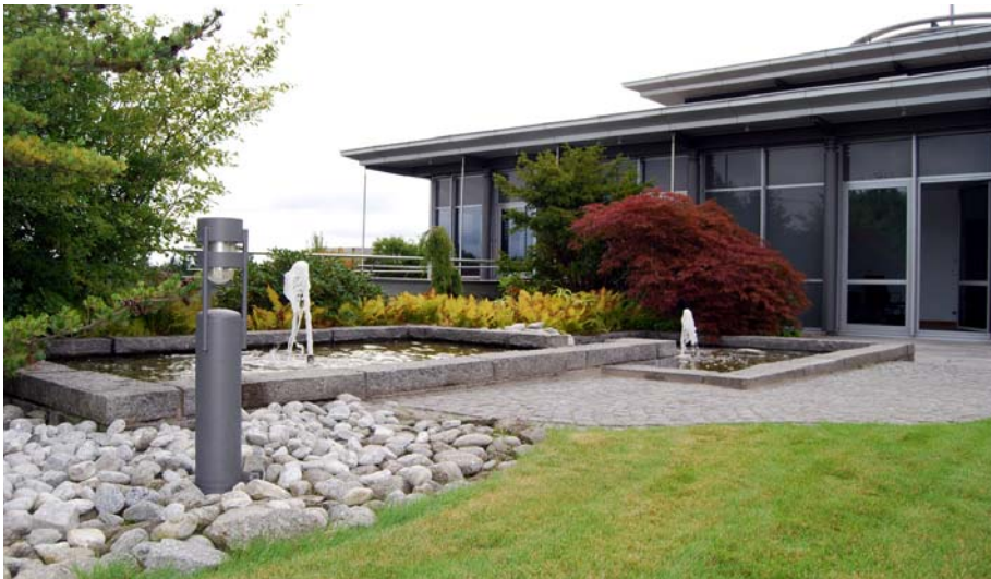
The small paved area makes for a smooth transition between the water features and the putting green.