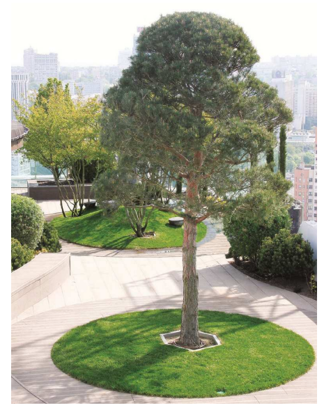
The garden centrepiece, a pine over 7 m tall and weighing 5 t.