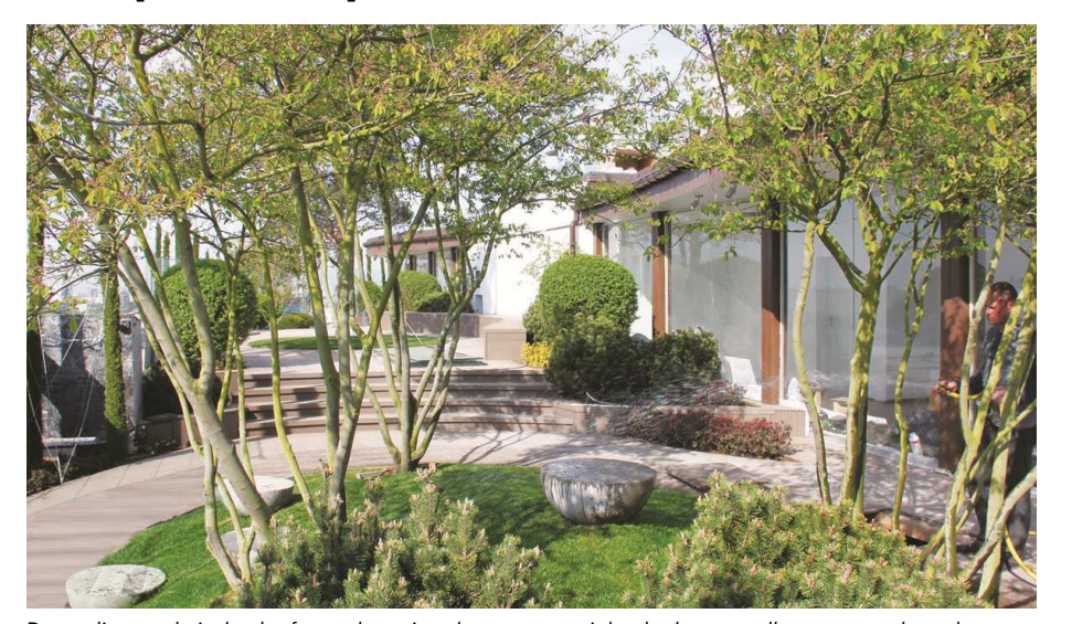
Depending on their depth of growth, various lawns, perennials, shrubs or small trees were planted.