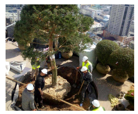
The latest Green Roof Technology enabled tall trees, such as Canadian Shadbushes, pine and maple (3.5–7 m), to be planted. A specially designed technological device which anchors the root ball of the central pine was used.