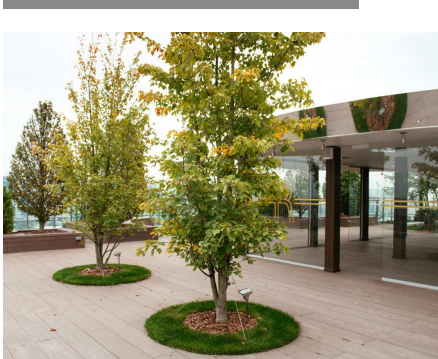
Outdoor recreation is possible within the city on the 32^{nd} floor.

Plant layer with perennials, shrubs and trees