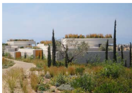
... but also with grasses which are typical for this region and can cope with the heat very well.