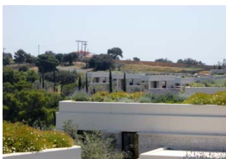
The roofs were predominantly planted with aromatic herbs and small shrubs,