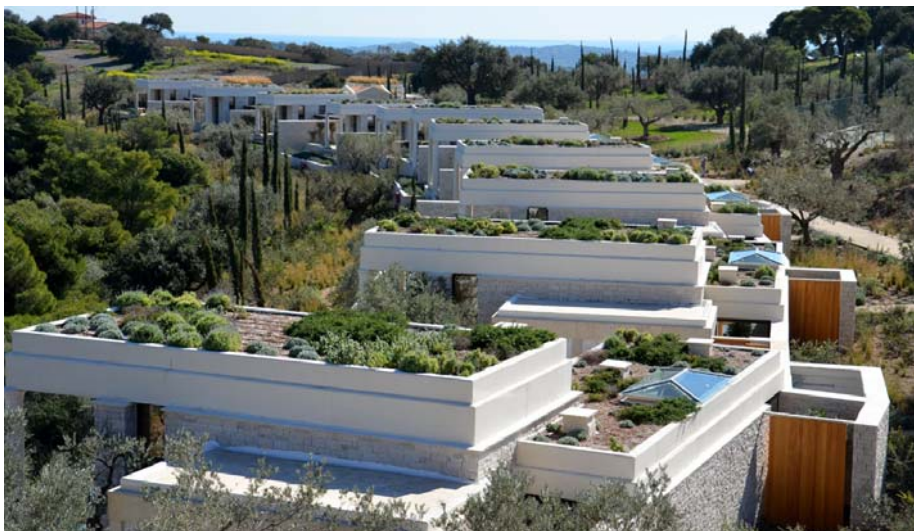
The green covered pavilions of the Amanzoe hotel complex harmoniously blend into the surroundings.