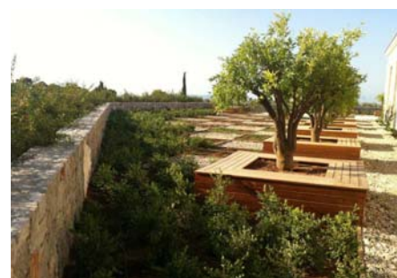
The room for root development of the olive trees was extended by special planting troughs.