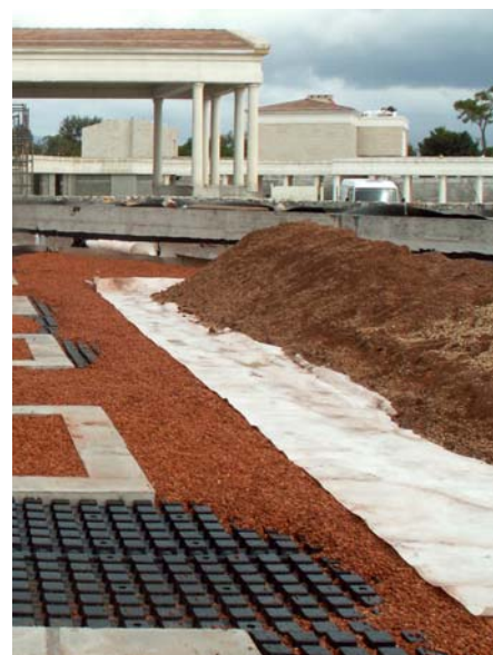
Floradrain® FD 60 elements were applied and infilled with Zincolit® Plus on this entire roof surface, also in the plant troughs which were meant for olive trees.