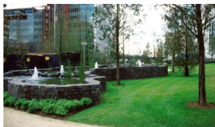
View over the sprawling lawn interspersed with solitary trees and winding paths.