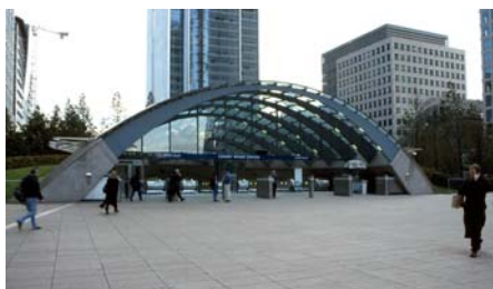
Large entrance leading to the Canary Wharf tube station.