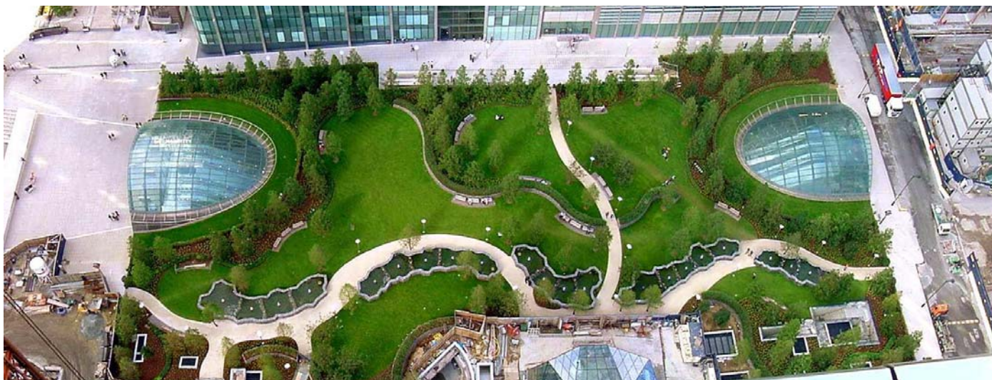
The “Jubilee Park” from above, surrounded of high buildings.