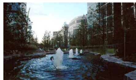
Serpentine stone basins with fountains are the dominant feature of this landscaped park.