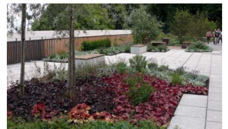
The completed green roof about three months after the opening.