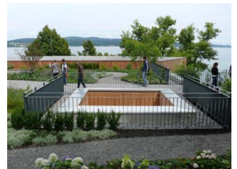
Custom-made guardrails were installed on the ZinCo Guardrail Bases all along the atriums and any other edges.