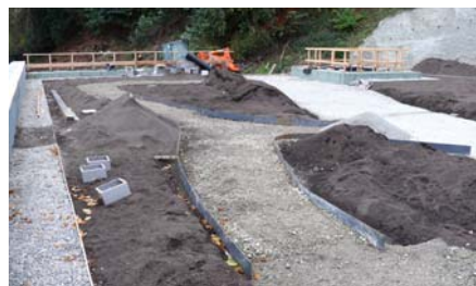
Paths and planting areas during the landscaping works.