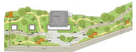
The draft plan shows how the roof garden is integrated into the surrounding landscape. A path which is accessible even with smaller maintenance vehicles crosses the entire roof.