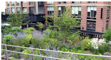
More than 200 different plant species were used.