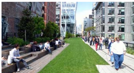
The section 2 with another 800 m of length contains also a lawn which can be used for sunbathing.