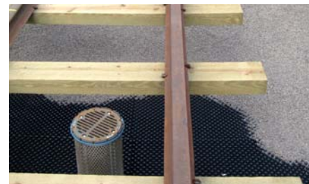
Installation of the green roof build-up under the rails. The drainage layer consists of infilled Floradrain® elements.