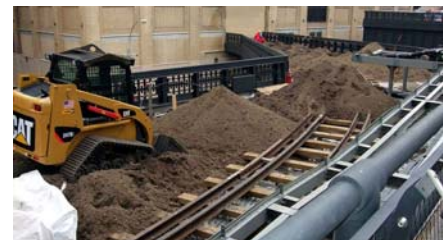
The average substrate depth is 450 mm.