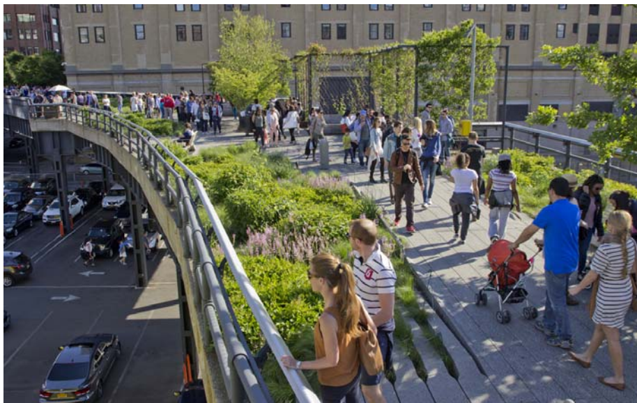
More than 20 million people have visited the High Line Park so far.