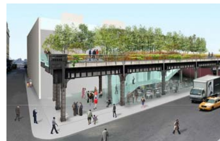
Today's appearance very much resembles this project outline (2003).