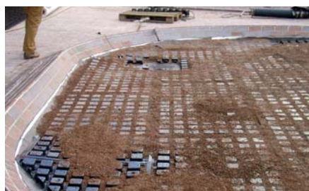
The drainage element Floradrain® FD 60 provides sufficient water retention capacity and made the old permanent irrigation system superfluous.