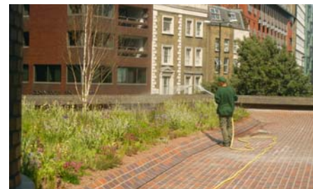
Additional hand irrigation is only required during the first year establishment phase.