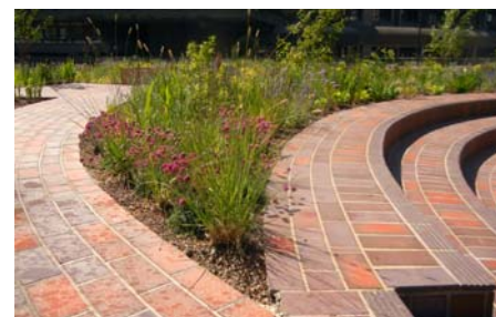
The planting beds were kept to the original layout, however, the vegetation was completely replaced on top of the newly laid out FD 60 build-up.