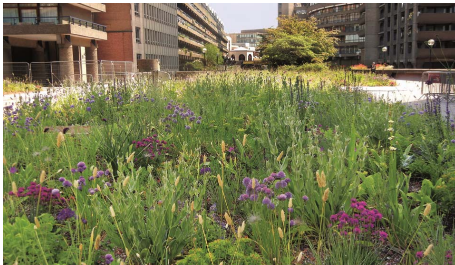
Beech Gardens as part of the Barbican Estate provide recreational green space in the City of London.