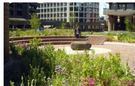
A naturalistic meadow-like wildflower vegetation was chosen tolerating low water availability and requiring little maintenance throughout the year.