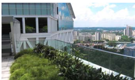
A garden floating in the sky.