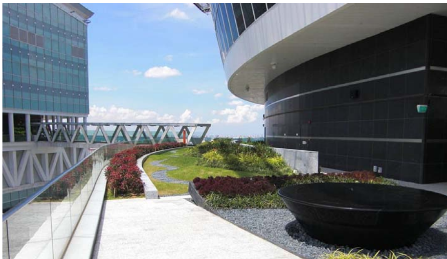
The Singapore Fusionopolis complex is even planted on the 24 th floor.