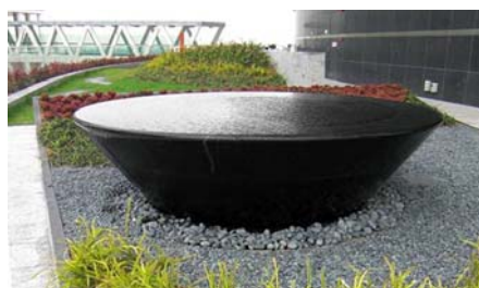
Water basin on the 22 nd floor in an exposed position.