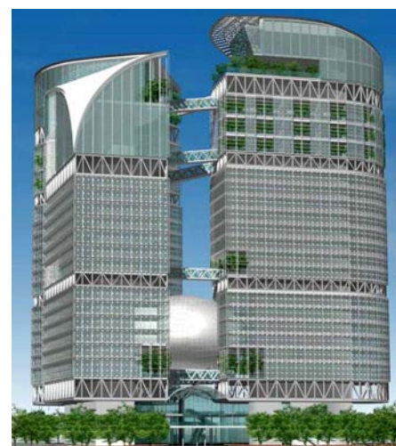
The three Fusionopolis towers are connected by skybridges.

practical use for the occupants. The main gardens are situated on the crucial floors with the transitions to the other towers. These roof gardens have a dense vegetation comprising trees with heights of up to 5 metres and shrubs of up to 1.5 metres. Furthermore, many small but visible gardens were built on balconies in the outdoor areas of all of-fices. They were spread over the total height of the complex.