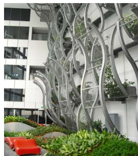
Very impressive type of vertical greenery.