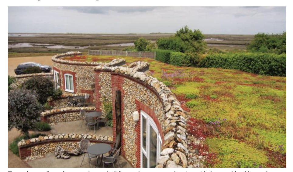
The sedum roofs on the natural stone building make a spectacular view with the marshland beyond.