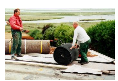
The Floradrain® FD 25-RV drainage element is provided in rolls and has an attached filter sheet SF.