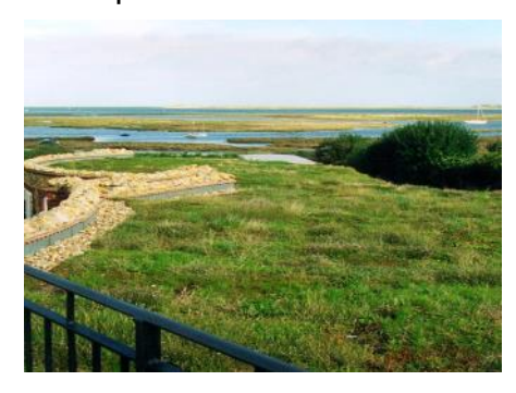
Depending on the season, the sedum roof shows in green or reddish colours blending in fabulously with the marshlands or the natural stone building.