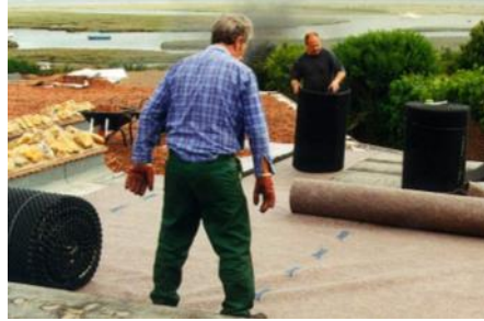
The protection mat SSM 45 was laid out as a base layer protecting the root resistant waterproofing.