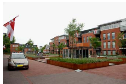
The decking of the parking garage can be driven on safely due to the extremely stable and highly pressure resistant drainage element. Thus long lasting functionality is guaranteed.