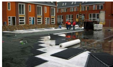
On top of the root-resistant roof construction of the parking garage the system build-up "Driveway" based on the drainage element Stabilodrain® SD 30 has been applied. This drainage element is quick and easy to be installed.