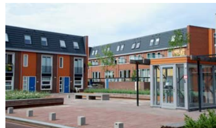
A glass staircase leads from the underground parking garage to the top.