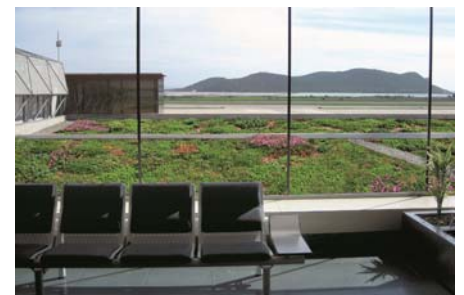
View from the waiting hall on the large-scale planting.