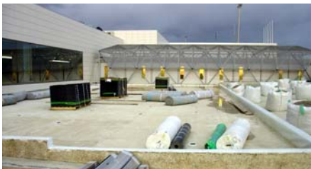
Protection mat, drainage elements and filter sheet are ready for installation.