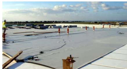
Preliminary work on the roof area to be vegetated.