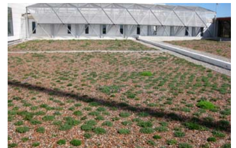
The roof area a few months after the plug plants have been planted.