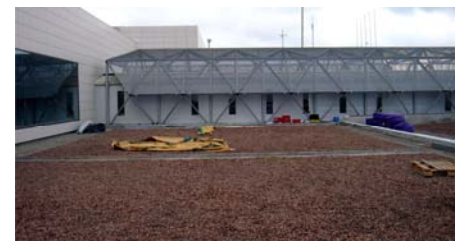
The roof area just after the application of substrate with BigBags.