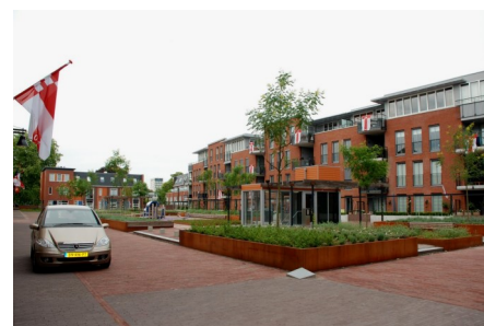
The decking of the parking garage can be driven on safely due to the extremely stable and highly pressure resistant drainage element. Thus long lasting functionality is guaranteed.