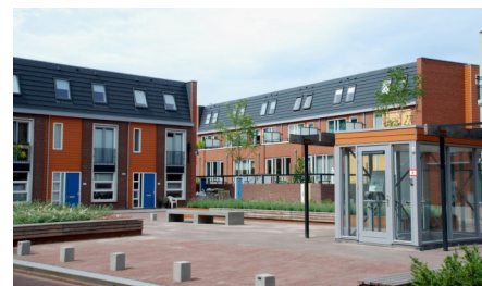
A glass staircase leads from the underground parking garage to the top.