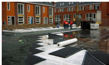
On top of the root-resistant roof construction of the parking garage the system build-up "Driveway" based on the drainage element Stabilodrain® SD 30 has been applied. This drainage element is quick and easy to be installed.