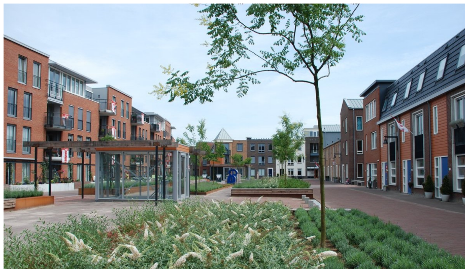
The attractively designed, about 2.500 m 2 large courtyard invites the visitor to linger.