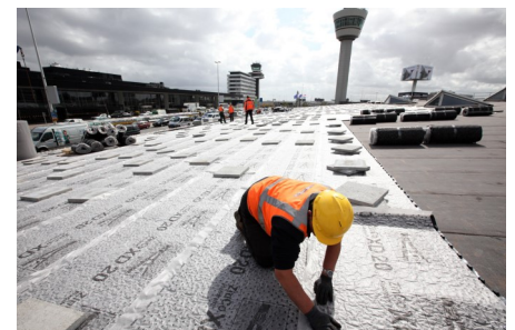
Especially for the Schiphol project ZinCo delivered the drainage element Fixodrain® XD 20 equipped with an additional protective rubber mat attached on the underside.