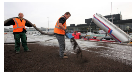
The System Substrate "Sedum Carpet" was brought up to the roof and distributed evenly by means of silos.