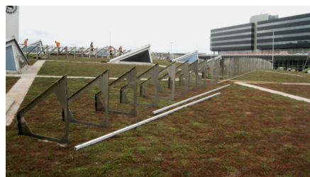
The Solar Base Frames were well adapted to the slight inclination of the roof construction.