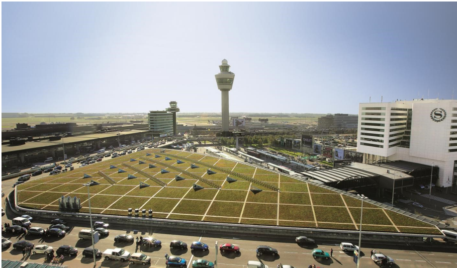
The Schiphol Plaza (central entrance hall) at Schiphol Airport in Amsterdam is the first object in the Netherlands combining a green roof with a solar system.