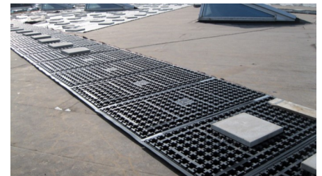
The Solar Bases® SB 200 allow for the installation of the solar modules, kept in place only by the weight of the green roof substrate itself.