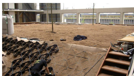
The proposed turf was intended to invisibly connect the pitched roof area to the flat roof area.