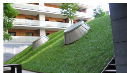
The pitched roof shortly after installation of the turf. Skylights allow for natural daylight inside the building.