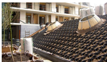
Two layers of Georaster® filled with substrate ensure proper supply of water and nutrients for the lawn.