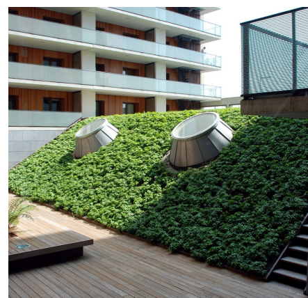
The maintenance of the lawn turned out to be costly. Therefore it was exchanged by a low maintenance ground cover planting.