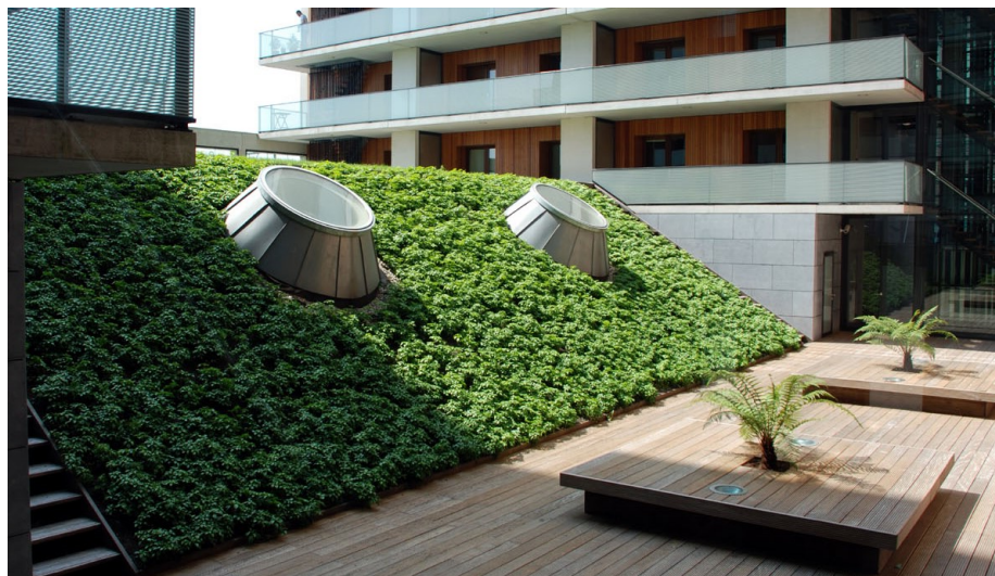
The inner courtyard of the "Australiëgebouw" with Pitched and Flat Green Roof.