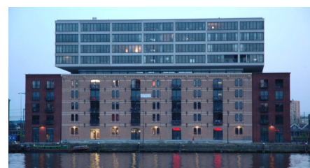
View from the Java island to the former warehouse.

Therefore, two layers of Georaster® were installed to accommodate more substrate. Later after maintaining the lawn on the steep pitched area turned out to be too costly the lawn was exchanged by a low maintenance ground cover planting.