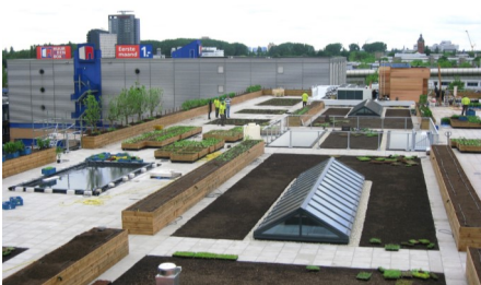
The system build-up "Sedum Carpet" with Fixodrain® XD 20 was applied between the skylights ...