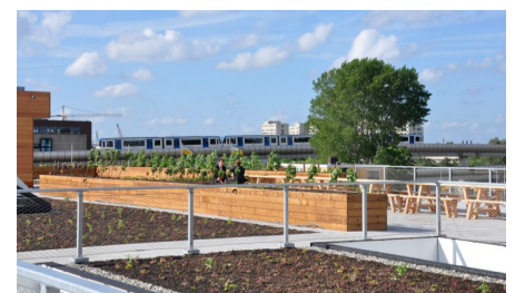
Shortly after the completion of the roof area, the extensively vegetated areas in the foreground.