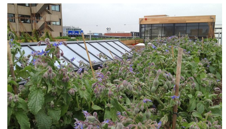
Even herbs, such as the beautifully flowering borage are growing in the small vegetable gardens of the rooftop farm.

the approximately 30 x 100 m large roof. The staff of this commercial complex has the possibility to grow and maintain their own fruits and vegetables on one part of the roof surface. On the rest of the surface, vegetables are also being grown, which are used in the company canteen. Here the system build-ups "Urban Rooftop Farming" on the proven Floradrain® FD 40-E element as well as "Sedum Carpet" with Fixodrain® XD 20 have been applied.