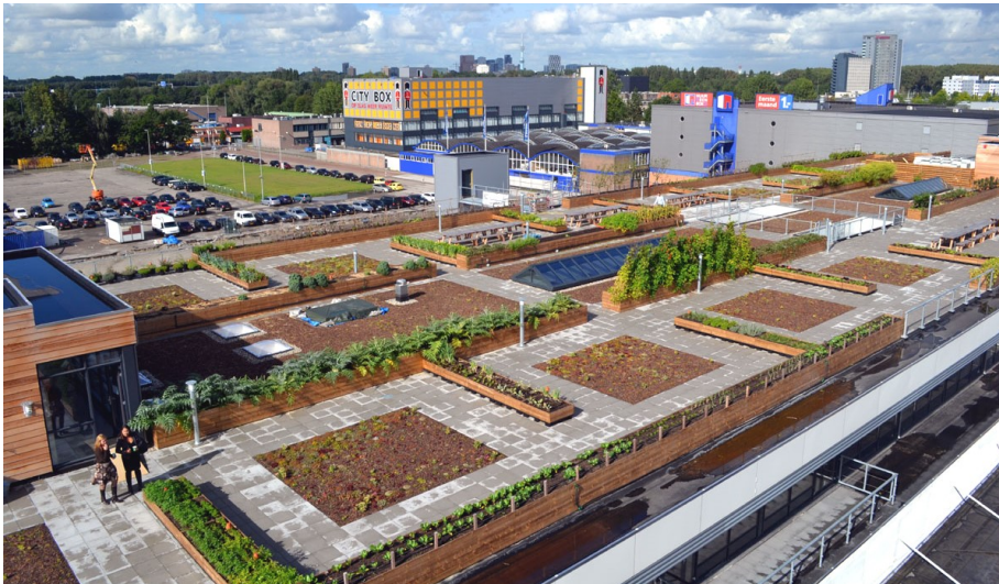
The rooftop farm of Zuidpark can be used both for lunch and for corporate events.