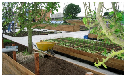
... whereas the build-up "Urban Rooftop Farming" including FD 40-E was applied on the raised planting beds.