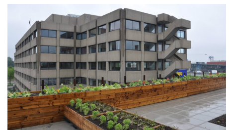
The green roof can be seen perfectly from the offices of the higher opposing building - a welcome change in an area predominated by industrial buildings.