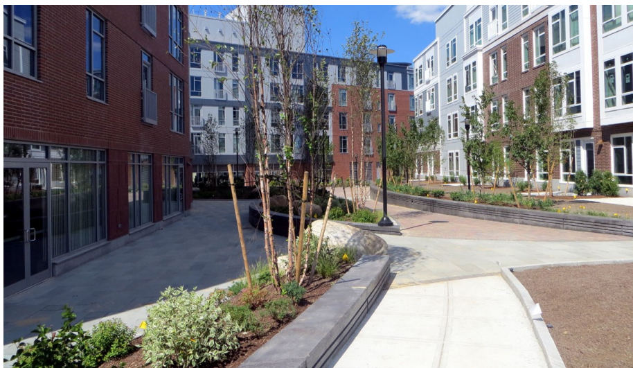
This photograph hardly reveals that this beautifully designed courtyard is located on a roof.