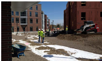
The System Filter Sheet PV has been installed below and on top of Stabilodrain® SD 30.