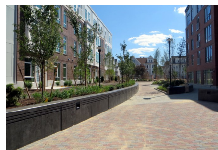
The courtyard, that was designed by landscape architects, was very well received not only by the residents.