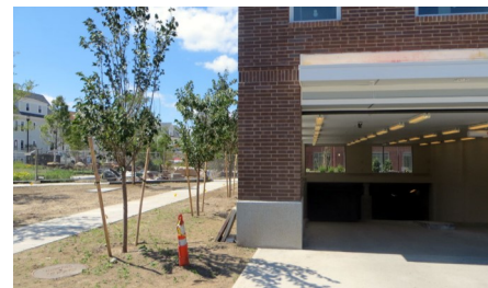
Only the garage entrance reveals that the courtyard is located on a roof surface.