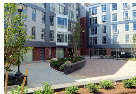
The planting areas have been delimited from the remaining roof surface by low kerbs from one side and by benches from the other side.