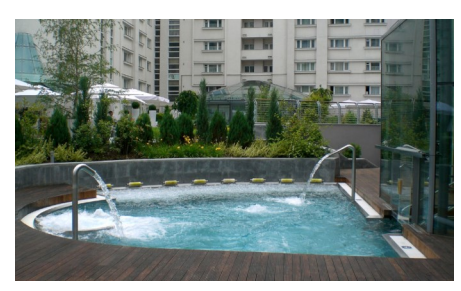
Europe's largest outdoor whirlpool is situated in the Radisson Hotel courtyard.