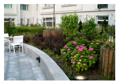
Curved planting beds with various small plants, shrubs and trees are built along the walkways.

Roof construction with root resistant waterproofing