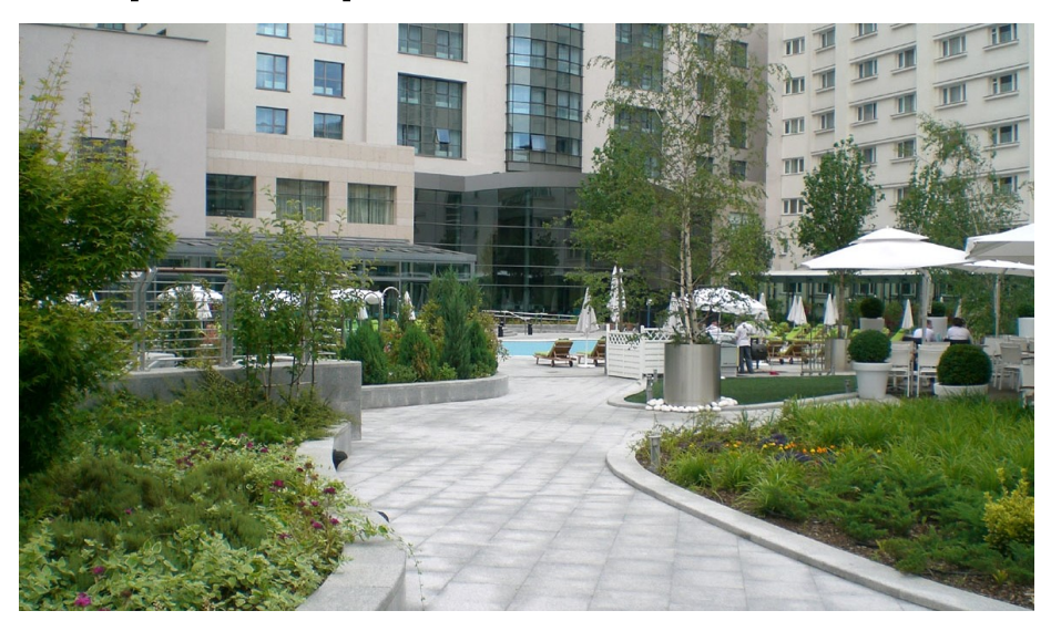
The green outdoor area of the hotel contributes to a pleasant stay of the guests.