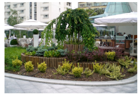
An integrated automatic irrigation system in the planting beds ensures adequate water supply of the plants.

build-up "Roof Garden" with Floradrain® FD 60 drainage elements was installed on the roof of the underground parking garage. Due to its high water retention capacity, this build-up can be used for lawns and shrubs and with at deeper substrate layer also for large shrubs and trees. Floradrain® FD 60 is also used under concrete slabs, wooden decks and pavings.