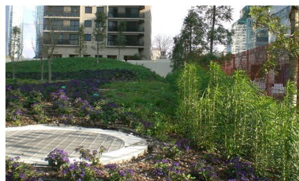
Close-up of the vegetation on top of the underground parking.