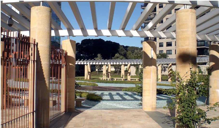
The roof garden on top of the underground parking in front of the Torre YPF, Buenos Aires.