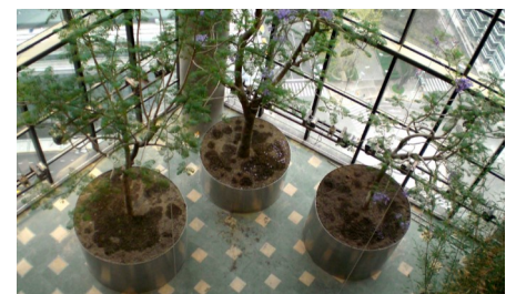
Planter boxes behind the glass facade.