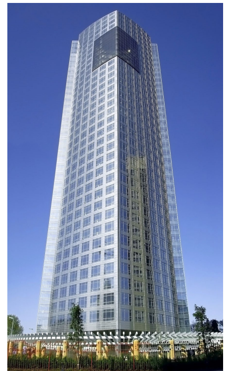
The 160 m high tower rises in the sky.