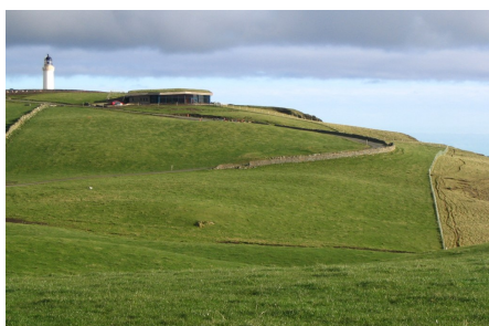
The 26 m high lighthouse and Gallie Craig housing a restaurant and gift shop are local attractions.