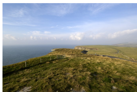
Located in a nature reserve, special planning and approval was required to build Gallie Craig