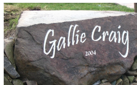
Gallie Craig - named after the "Mull of Galloway" headland rising out of the sea like a "craggy rock".