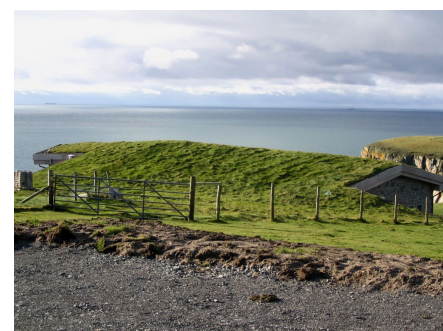
The green roof connects seamlessly with the surrounding grass and heather landscape, making the building almost invisible.