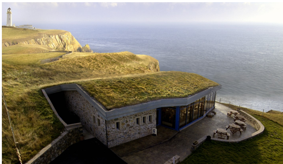
Due to the turf roof, an extraordinary level of harmony with the surrounding landscape was achieved.