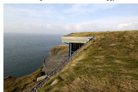
Gallie Craig sitting on almost vertical cliffs offers breath-taking views across the Irish Sea