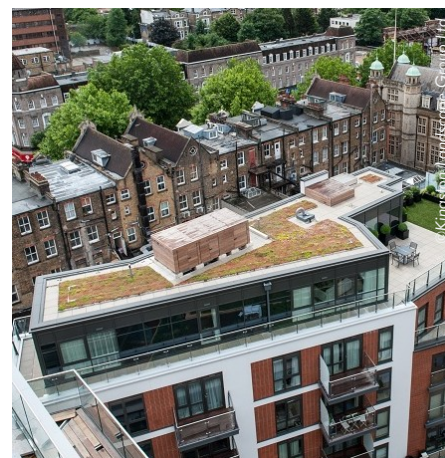
A green roof with sedum matting and aluminium edging was installed on one of the buildings.