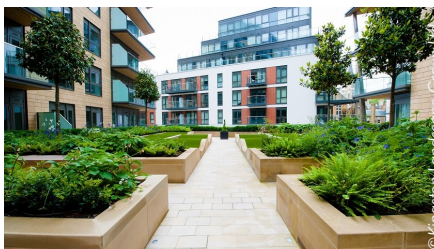
All courtyards were built on top of an underground carpark requiring suitable podium build-ups for drainage management.