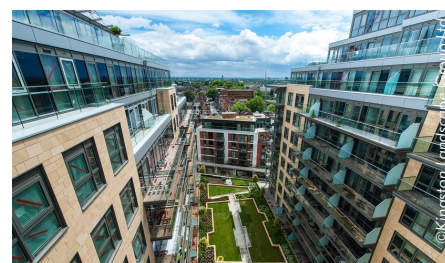
View from above onto one of the courtyards of Dickens Yard residential development.