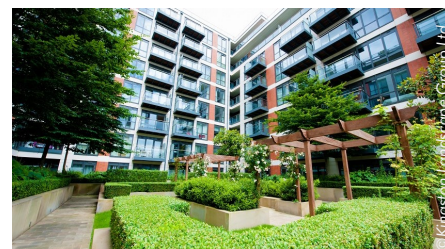
Residential courtyard with large trees and dense hedging and a wooden pergola.