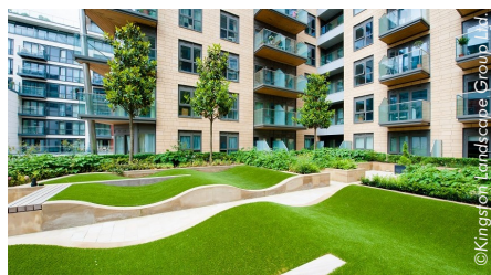
An open design courtyard with rolling mounds made from artificial grass and integrated benches inviting the residents to stay.