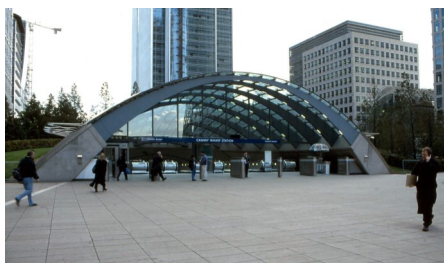
Large entrance leading to the Canary Wharf tube station.