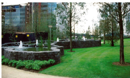
View over the sprawling lawn interspersed with solitary trees and winding paths.