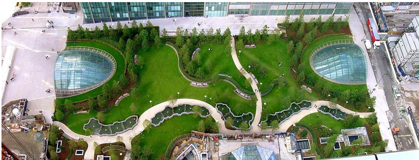
The “Jubilee Park” from above, surrounded of high buildings.