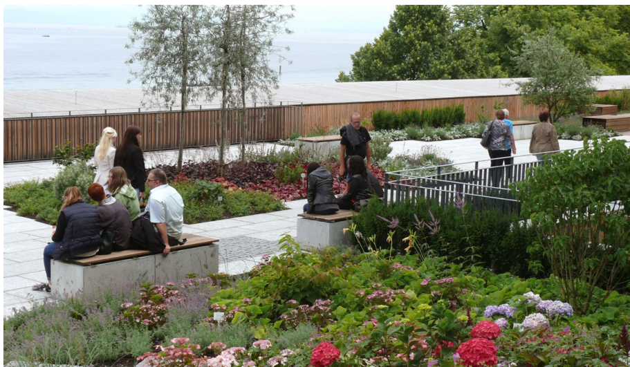
The roof garden of the Comturey Restaurant offers visitors an overwhelming view of Lake Constance.