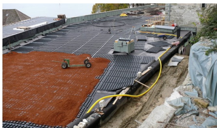
The drainage and water storage element Floradrain® FD 60 makes sure that the overall roof area is being drained properly via its two narrow edges.