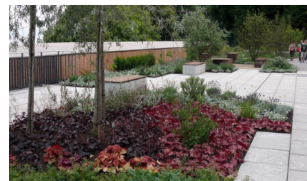
The completed green roof about three months after the opening.