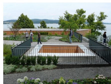
Custom-made guardrails were installed on the ZinCo Guardrail Bases all along the atriums and any other edges.