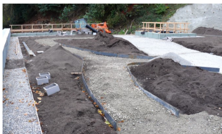
Paths and planting areas during the landscaping works.