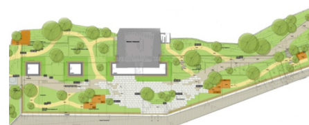
The draft plan shows how the roof garden is integrated into the surrounding landscape. A path which is accessible even with smaller maintenance vehicles crosses the entire roof.

their way from the harbour to the castle. The design was the result of an architectural competition. On top of the zero-degree roof construction the system build up "Roof Garden" based on the drainage element Floradrain® FD 60 was applied. The weight of the green roof build-up played an exceptional role in the construction as it contributes to the building withstanding the slope pressure.