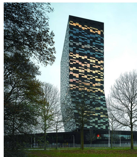
The kink in the construction is the hallmark of FiftyTwoDegrees.