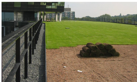
Pre-cultivated lawn was spread evenly to receive an immediate finished look.