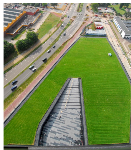
Automatic irrigation was installed to provide regular water supply for the entire roof area.