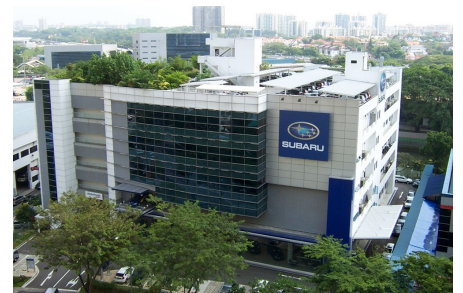
View from a neighbouring building onto the roof of Subaru headquarters.

the circuit, such as humps, rocks, a sand trail and even a waterfall. The all-wheel drive test track was installed on top of the heavy duty drainage element Elastodrain® EL 202, which offers excellent protection to the waterproofing membrane and even caters for wild cornering. Besides, it provides for perfect drainage, most important during heavy tropical rain.