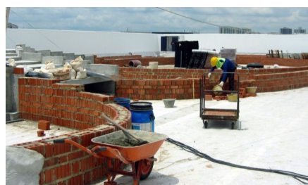
Features such as ramps and bridges were built on top of the protection and drainage layer.