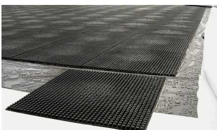
Elastodrain® EL 202 was fully laid above the Slip Sheet TGF 20.