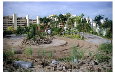
The sand track allows a smooth gliding. Rocks, wooden sleepers, etc. were also integrated within the circuit.