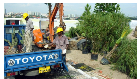
Local palm trees were planted in a 1,20 m deep substrate layer.