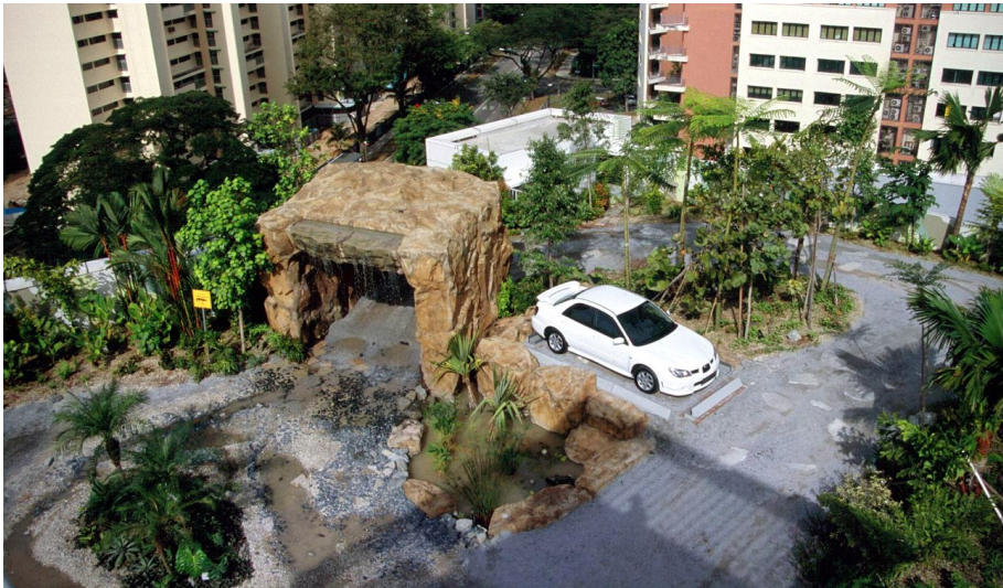
All-wheel driving pleasure on the Subaru roof top in Singapore.