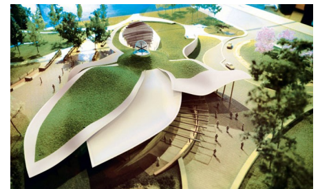
The architect's model shows the shape of orchid leaves; The visitor centre has already been awarded the LEED Platinum Status for environmentally friendly and sustainable constructions.

Hahn Oberlander, known for the perfect integration of her landscaping into the overall architectural concept. Due to the varying inclinations and curvatures of the roof surface three different systems were applied: on the flat areas a build-up based on Floradrain® FD 40-E, on the pitched roof areas a build-up with Floraset® FS 75 and on the steep roof areas a build-up with Georaster®.