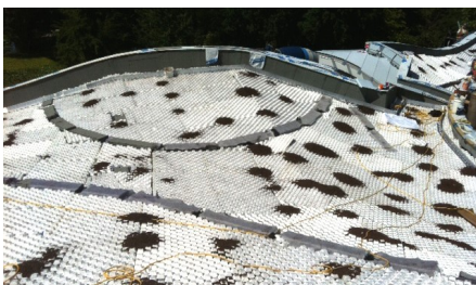
The roof of the visitor centre shortly after the installation of the Floraset® FS 75 elements.