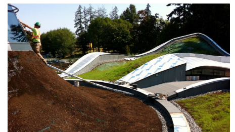
Shortly before completion of the roof surfaces.