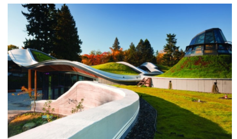
This photograph from October 2011 shows the lawn that already had developed well.