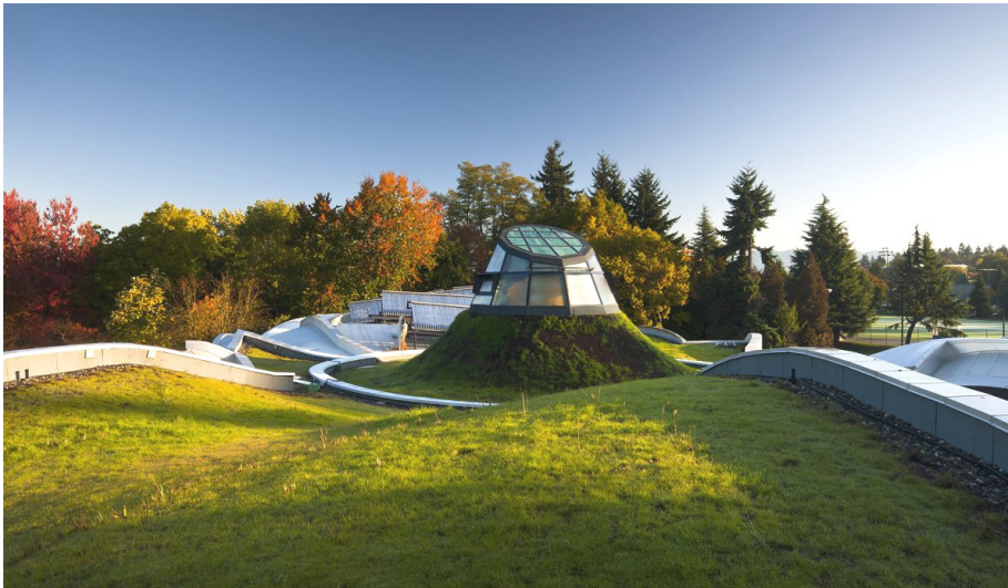
The green roof of the new visitor centre at the opening ceremony in October 2011.