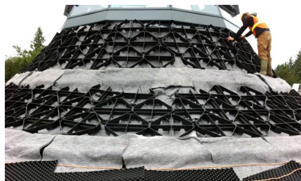
The Floradrain® elements adjacent to the pitched roof area where Georaster® was applied.