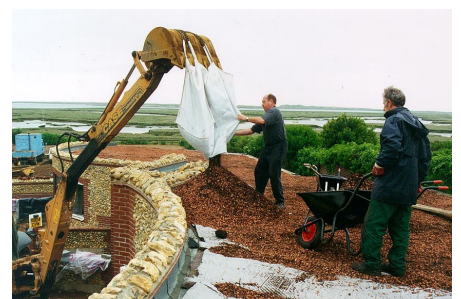
A blend of sedum carpet aggregate was applied as a growing medium for the vegetation mats.