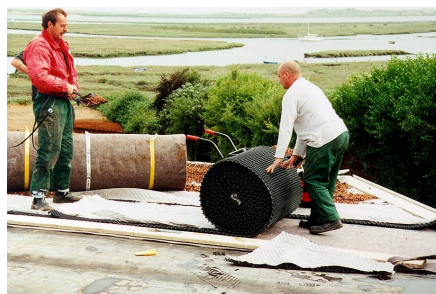
The Floradrain® FD 25-RV drainage element is provided in rolls and has an attached filter sheet SF.