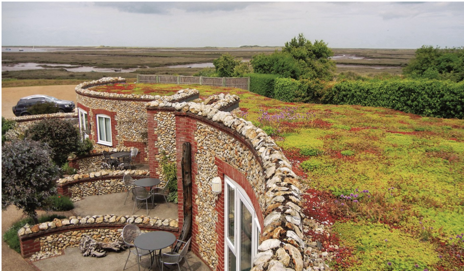
The sedum roofs on the natural stone building make a spectacular view with the marshland beyond.