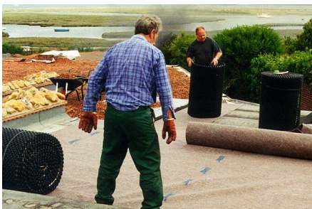
The protection mat SSM 45 was laid out as a base layer protecting the root resistant waterproofing.