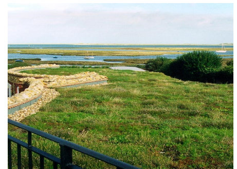
Depending on the season, the sedum roof shows in green or reddish colours blending in fabulously with the marshlands or the natural stone building.