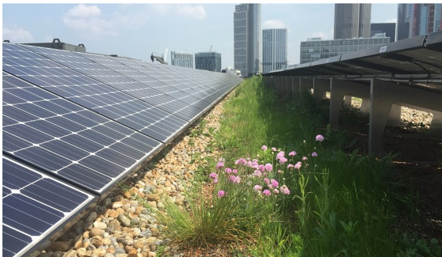
The refurbishment included a new solar installation and a green roof replacement to improve biodiversity.