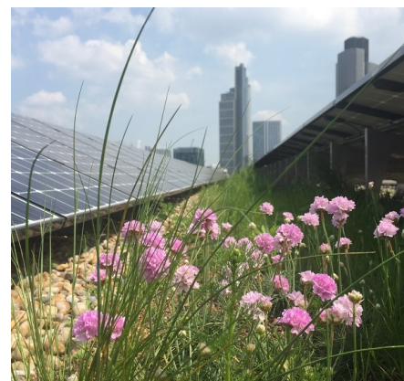
During refurbishment the old sedum roof was adapted to take a greater variety of vegetation.