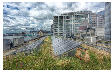
This biosolar roof, as it is called by livingroofs.org , celebrates the synergies between renewable energy and green roofs.

The solar frame inclinations and the distance between rows had to be carefully planned by the ZinCo technical department to avoid shading of the solar panels and reducing their efficiency. For the same reason suitable plants not growing too high had to be selected. Evapotranspiration from the green roof helps to keep the ambient temperature on the roof below a max. of approx. 35° C thus increasing the PV panels efficiency.