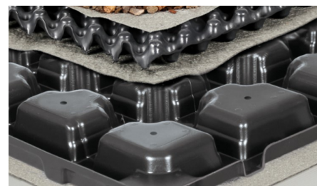
The "Stormwater Management Roof" is made up of various layers, with the Retention Spacer (here RS 60) being the core piece of the build-up.

On all roofs the "Stormwater Management Roof" build-up came to use. While RS 60 spacers were installed as system core pieces on the blue/green roofs, heavy duty RSX spacer elements were used on the landscaped podiums.