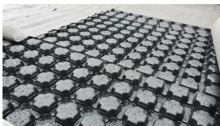
RS 60 retention spacers were used on all green roofs providing retention space below the wildflower/sedum build-up.