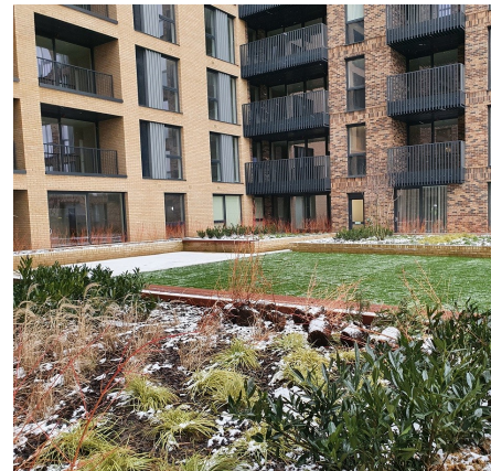
One of the podium decks during winter time shortly after installation.

Roof construction with root resistant waterproofing