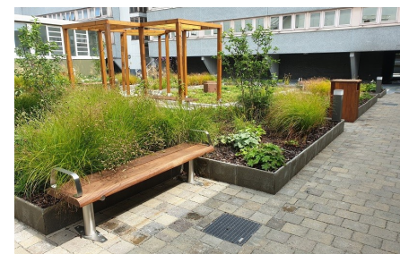
About one year after the installation the plants have developed well already reaching considerable heights.