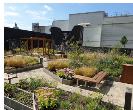
Different seating areas provide the possibility to meet, sit and relax for the benefit of social life.