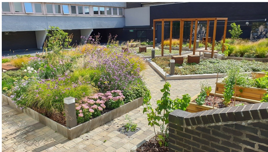
This colourful roof garden rich in species and structure providing beautiful views from the apartments around was built as a community space for the residents of this huge mixed-use building complex.