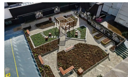
Victoria Centre Roof garden just after the installation was finished in March 2019.