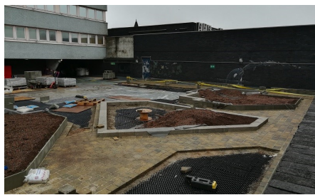
The drainage element Floradrain® FD 40-E was laid over the entire surface to provide good and uninterrupted drainage over the whole area.

Roof construction with root resistant waterproofing