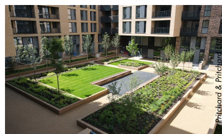
One of the blue podiums a few months after the installation. Vegetation has established very well.

Roof construction with root resistant waterproofing