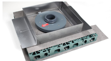
The flow controller is used to regulate the rain water run off within a pre-defined period of time.