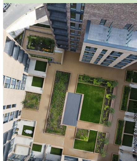
View from above onto one of the podiums and onto the street situated at a lower level.

On all roofs the "Stormwater Management Roof" build-up came to use. While RS 60 spacers were installed as system core pieces on the blue/green roofs, heavy duty RSX spacer elements were used on the landscaped podiums.