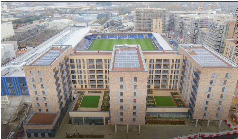
The huge mixed-use development at Wimbledon Grounds including vast 15,967 sqm area of 'blue' roofs and 'blue' podiums is one of the largest blue roofing projects in the UK.