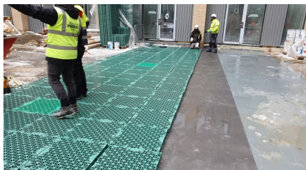
The heavy duty RXS spacers were laid on all podiums allowing them to be used as roof gardens with hard and soft landscaping.